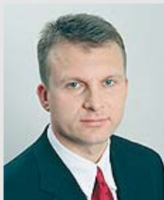
Ainars Slesers Ministry of Transport and Communications of the Republic of Latvia